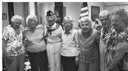
Pictured are members of the Green Mountain Waves.

Unit #109 (VT) - Seven members attended a delightful luncheon on July 11th at the Senior Center Meals-On-Wheels Café in Bennington, VT. The experience was enhanced by the special care the Center gave to our group by making us feel so welcomed by having prints of old period military "JOIN THE WAVES," as well as appropriate decorations, on the table.