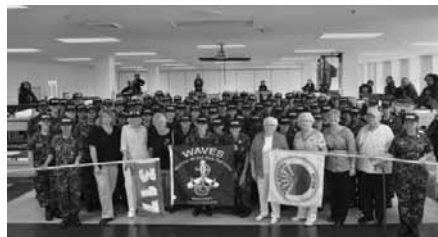
Badger members pose with the RTC Division they are sponsoring.