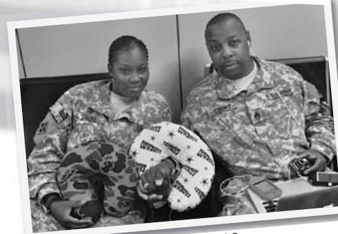
Cammo and Cowboys - DFW/USO