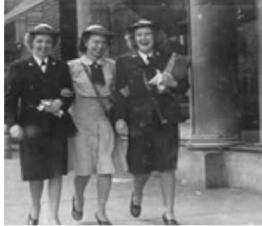
WWII WAVES—Photo courtesy of the website: www.homefromtheroines.com

Through oral histories and recently uncovered archival footage, Homefront Heroines: The WAVES of World War II, reveals a hidden history about the "greatest generation" of women who changed the course of American life. The WAVES, or Women Accepted for Volunteer Emergency Service, served in a variety of jobs, from yeomen and storekeepers to forecasting weather and sending/translating coded military messages from both the Allies and the enemy. WAVES also trained men in some of the key skills in the Navy: flying the newest aircraft and artillery training. They may not have realized it at the time,