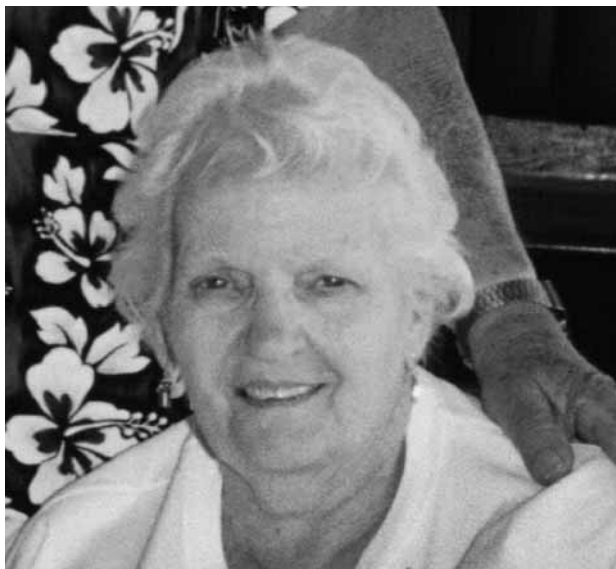
... and as she is today at her home in Anaheim, CA.