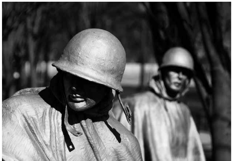
A dramatic scene from the Korean War Memorial

Also, the Commission is hosting a large event with the Secretary of Defense honoring all Vets of the Korean War on