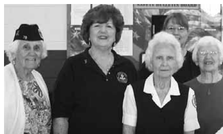
Space Coast WAVES volunteer at the Annual Stand Down.

Volunteers were kept quite busy handing out boots, knapsacks and other military items, personal hygiene kits and food packets, as well as civilian clothing and refurbished bicycles.