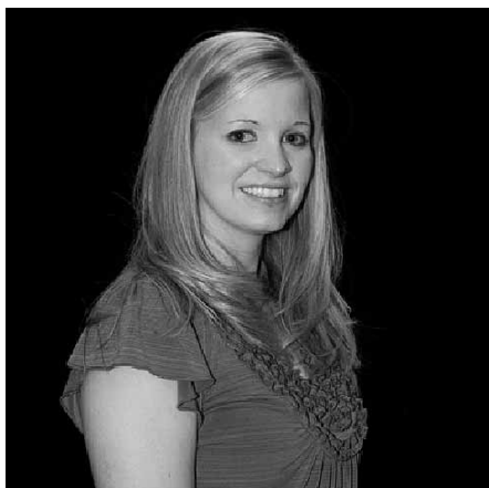
Keynote Speaker; Army PFC Jessica Lynch

The Ohio Women's Veterans Conference was held in Columbus, Ohio on