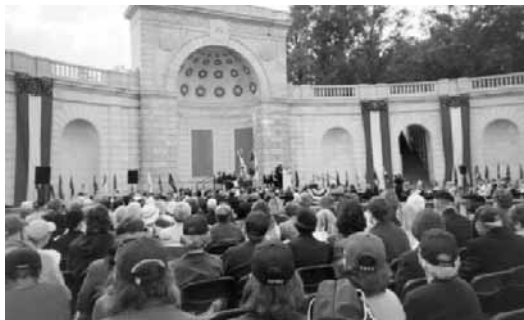
WIMSA Memorial Celebration

At 1830 in the evening, we assembled at the entrance to the Memorial Bridge on the DC side of the Potomac next to the Lincoln Memorial. The police had closed the bridge for this event. Everyone was lined up behind signs showing military service affiliation (USN, USMC, USCG, USA, USAF) for the Candlelight March and Service of Remembrance. Every person was given battery powered "candles". It was near dark and the lighted candles created a beautiful sight. We were lead back across the