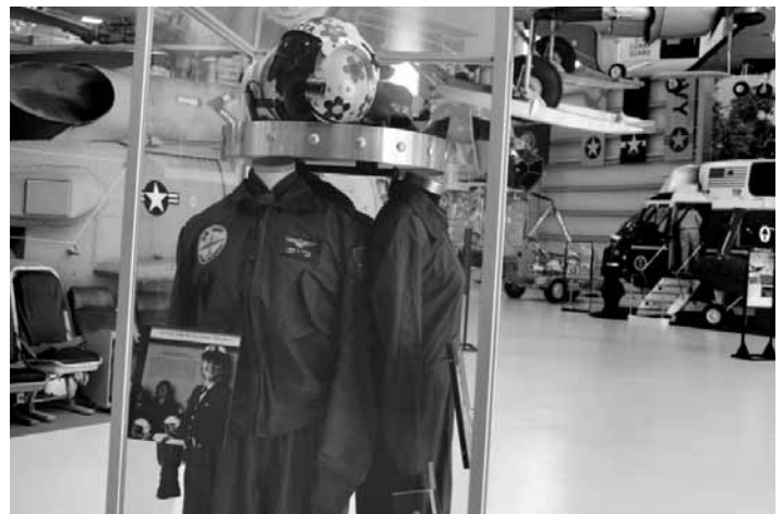
taken at the National Museum of Naval Aviation