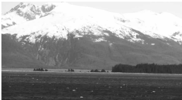
From the Alaskan Cruise in the area of Tracy Arm & Sawyer Glaciers