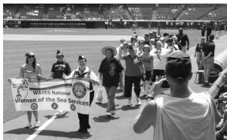
Cleveland Indians Red, White and Blue Salute to Women Veterans pre-game parade

guard, a female vet got to throw out the first pitch and a great day to watch the game (even though our Tribe lost).