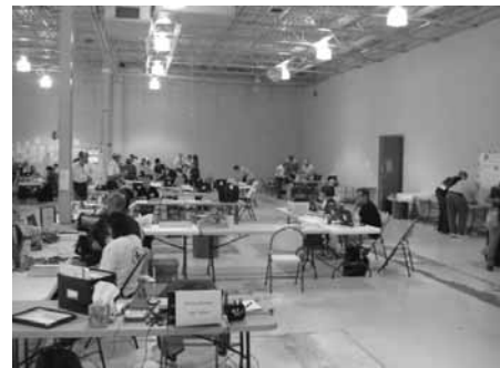
The ARC HQ was an old CompUSA store in Birmingham

My time in Alabama ended with me helping to close up the American Red Cross Disaster Response Headquarters in Birmingham.