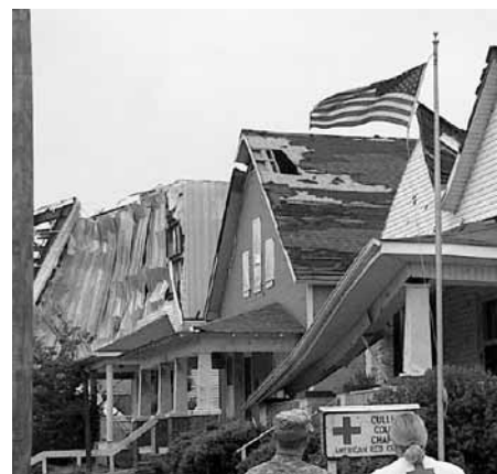
This was the Red Cross office in Calhoun County. Disaster hits everyone, even the American Red Cross.

It’s now hurricane season. So far this year the American Red Cross has responded to tornadoes in 18 states, flooding in 16 states and wildfires in 3 states. Are you ready if a disaster should strike near you? Do you have a disaster kit? Do you have a disaster plan? Do you even know what a disaster plan is? Do you know where to go for help to make a plan?