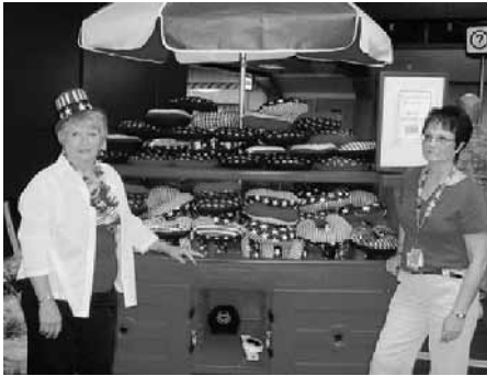
USO Volunteers pass out Pillows for Patriots at the DFW Airport.